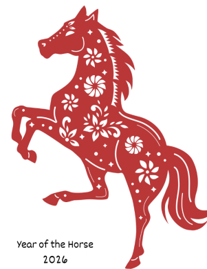
Year of the Horse 2026

Together, we'll honor cultural traditions, celebrate community, and share how ATASK empowers survivors.