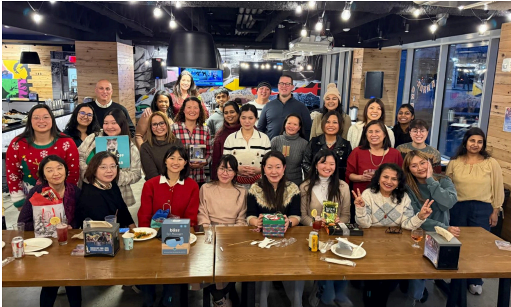
ATASK Staff at our holiday party, December 2025